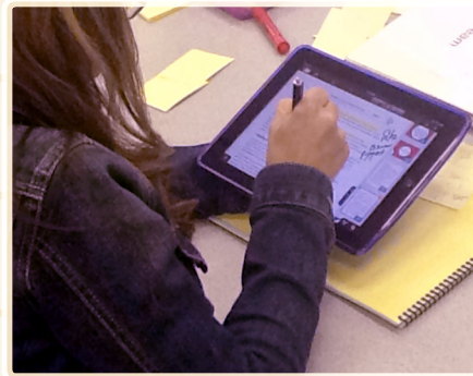
2 nd grade teacher, takes notes on the iPad regarding the Instructional Shifts in ELA at a recent teacher professional learning day.