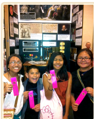
Fedde MS History Day Winners