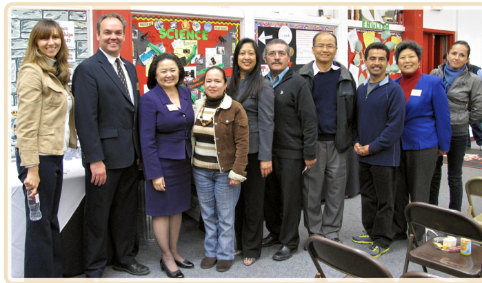
Superintendent's Community Form held at Fedde Middle School

Spring has arrived and there is a heightened air of activity throughout the District. On March 7 th , I presented the "State of the District" address at the Cerritos Regional Chamber of Commerce held at the Sheraton Cerritos. Civic leaders, business members and community representatives