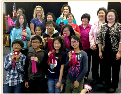
Kennedy ES students win first Elementary Reading Olympics